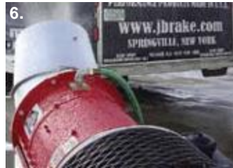
1. Gyratory Atomizing Nozzle